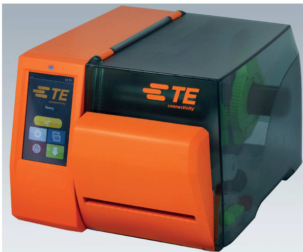
T2212 printer fitted with Cutter/Perforator.

For more details regarding printer accessories please consult TTDS-260, and for more details concerning the Universal reel holder please consult TTDS-259.