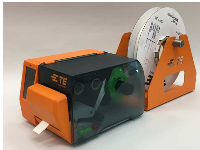
T2212 printer with the Universal reel holder.